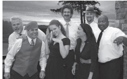
GLOW dance/show band

Entertainment for the banquet is GLOW. This group is a seven piece high-performance dance/show band specializing in exceptional vocals, harmony and great dance music. They put on an exciting show with emphasis on audience interaction. The committee feels this group will keep our dance floor packed with their large spectrum of danceable songs including the hottest pop tunes, standards, R&B, swing, disco, classic rock, country rock and slow ballads. Get your tickets early for this exciting band.