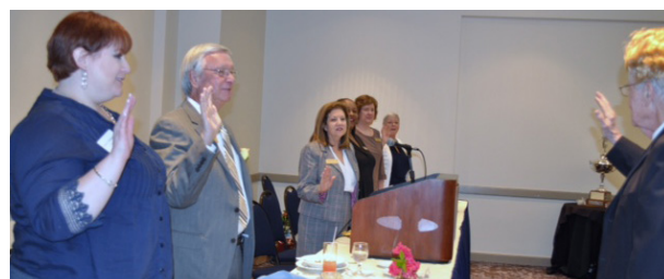
Photos from the swearing in ceremony